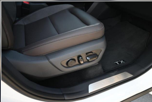
10-WAY POWER DRIVER AND PASSENGER SEATS