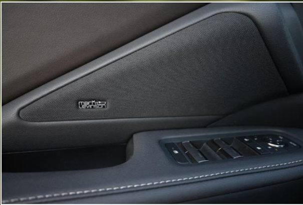
21 SPEAKER MARK LEVINSON PREMIUM AUDIO SYSTEM