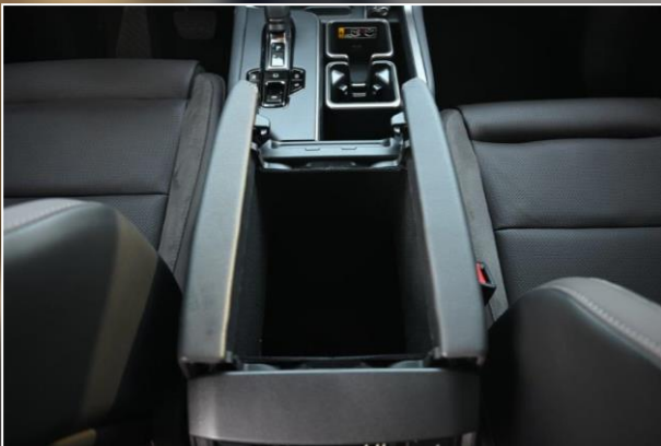
2 MODULAR CUP HOLDERS