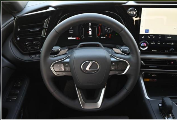
ADVANCED TOUCH STEERING WHEEL