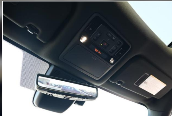
DIGITAL DISPLAY REAR VIEW MIRROR WITH HOME LINK