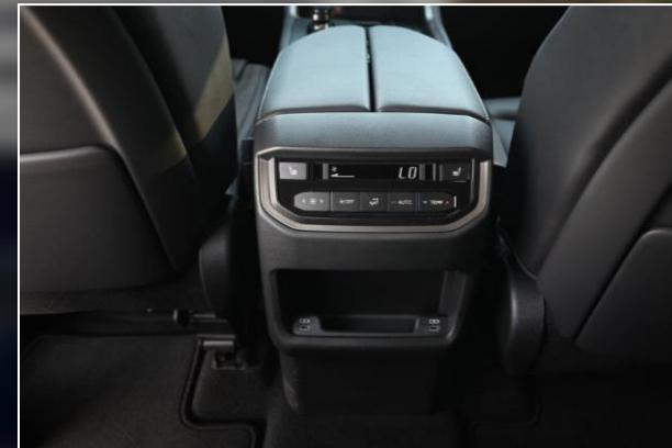
REAR AC & USB PORTS