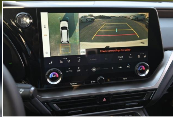
PANORAMIC VIEW MONITOR